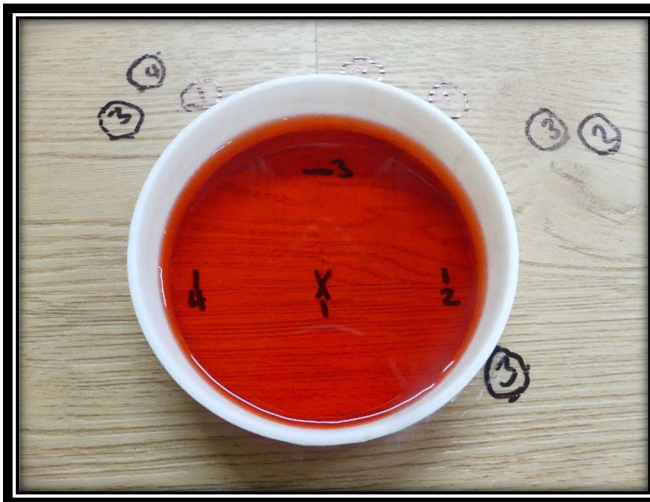
After 24 hrs With Water