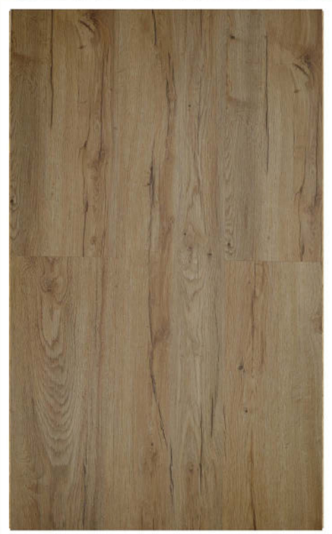
Natural Cracked Oak