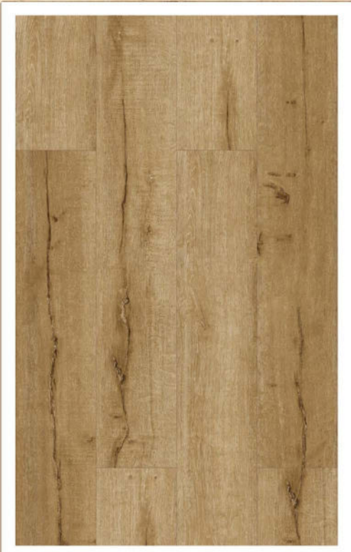
Natural French Oak