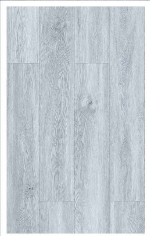
Frosted Grey Oak