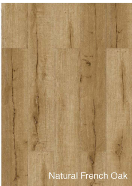
Natural French Oak