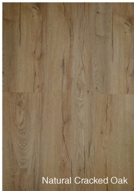
Natural Cracked Oak