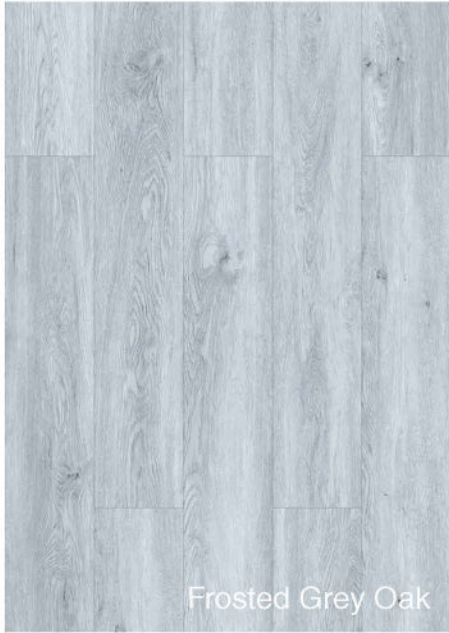
Frosted Grey Oak