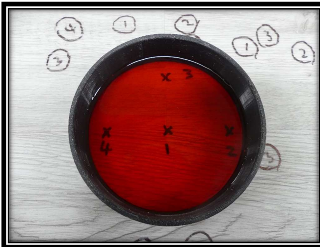
After 24 hrs With Water